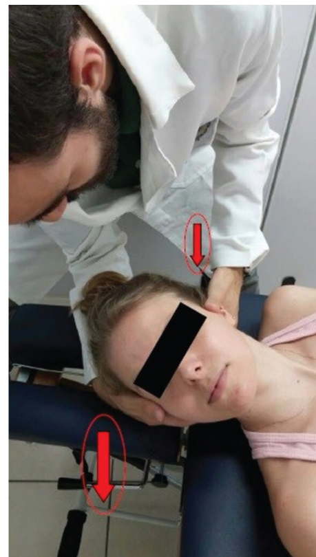
Figure 2. Sham Manipulative Procedure for the Cervical Spine. Small arrow: Chiropractor's hand on the paraspinal area in the restricted vertebra. Big arrow: Chiropractor's forearm as a support for patient head and giving a thrust against the drop headpiece.